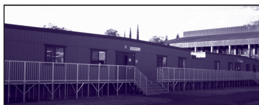
Picture of temporary Library swing space.

We hope to move back in during Summer of 2007.